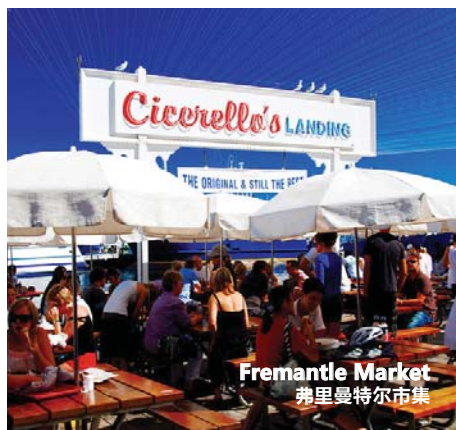
Fremantle Market 弗里曼特尔市集