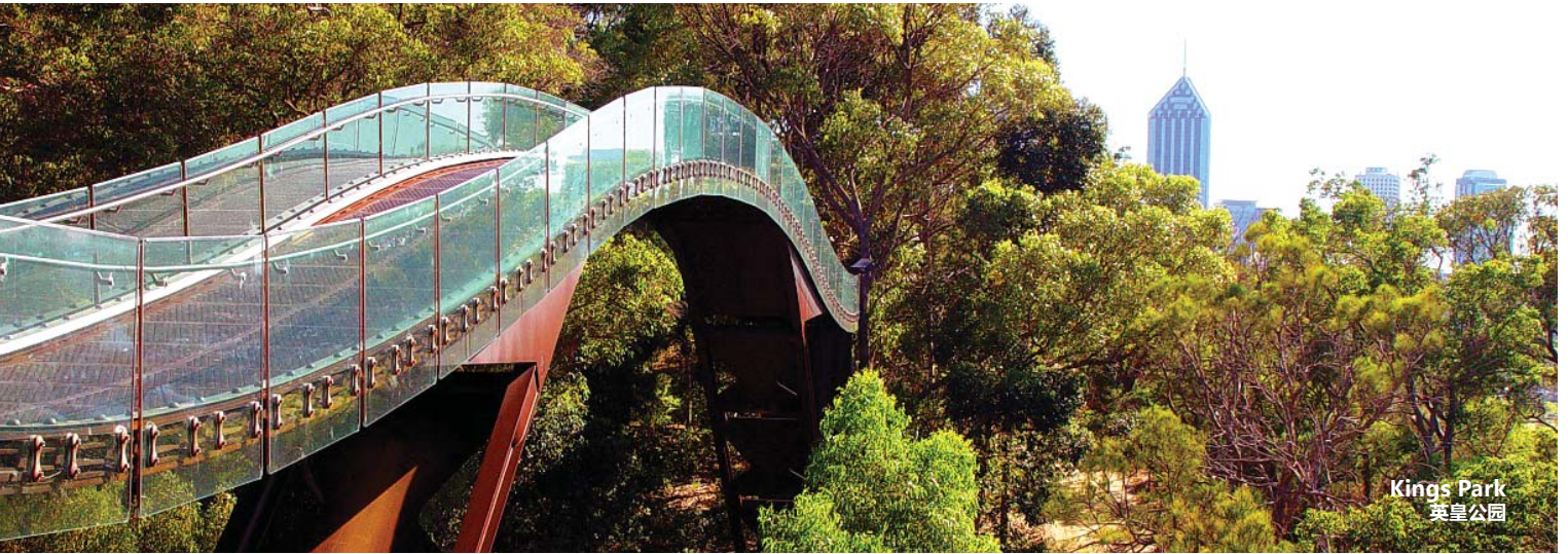
Kings Park 英皇公园